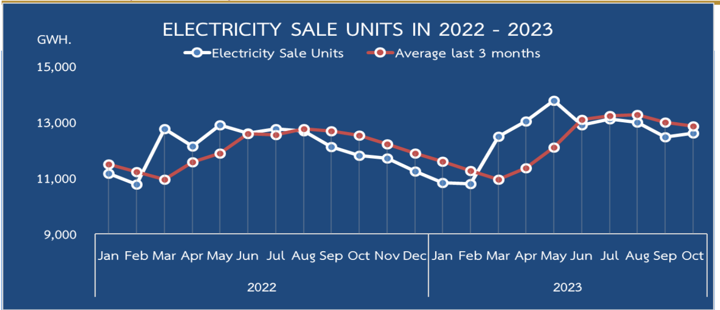
The Electricity Sales Report of PEA in October 2023

In October 2023, PEA had a total of 12,597.65 million units of electricity sales, which increased at 6.71% YoY. Because of the recovery of export and private consumption and investment following the labor market. Furthermore, the customer confidents' index was continue rising from a measure to support cost of living. The inflation rate was going down in energy and food sectors whereas, there were a number of tourists to visit Thailand during High season.